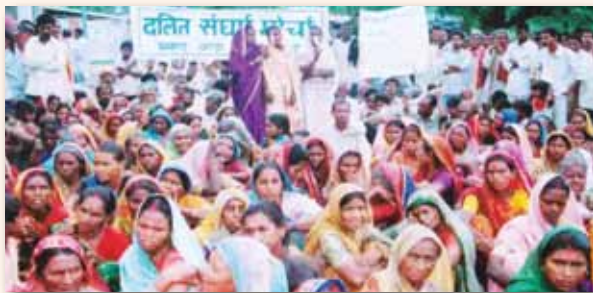
Dharna at Block Development Office for Proper utilization of Dalit Funds

The greatest achievement of the institutions is that it has been able to organize thousands of dalits in to community based organizations and capacitate them for claiming their rights following non-violent and democratic methods. The efforts of the organization in the fields of women empowerment, provisions of basic services to the deprived communities, gender mainstreaming and ending the discriminations practiced gender wise and caste wise across the state. The organization in this process has also established a strong networking relationship with the government departments as well as with a large number of civil society organizations.